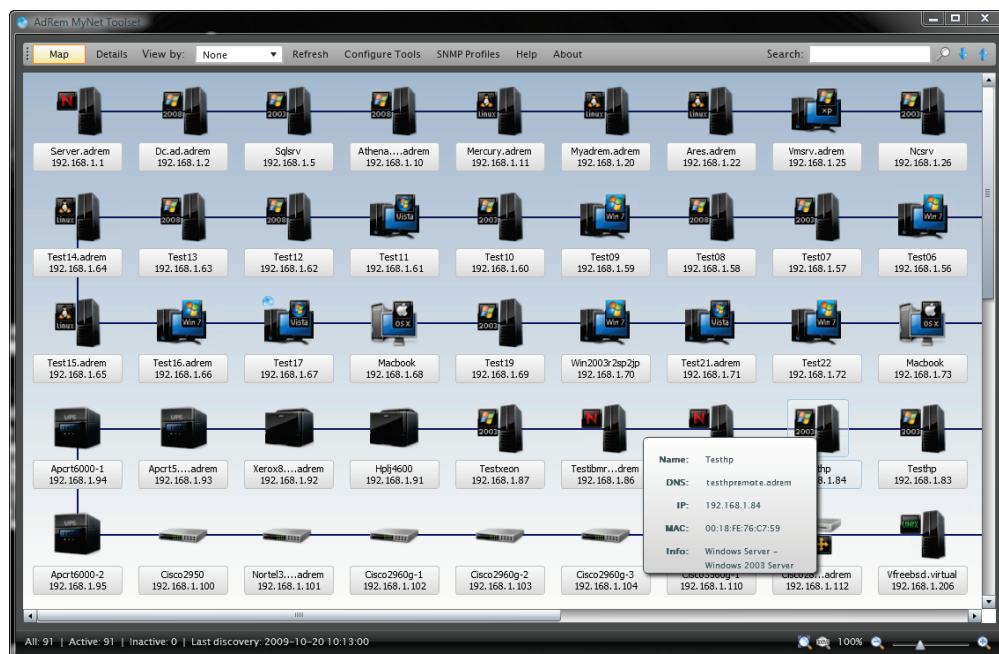
Figure 2 Main program window

The AdRem MyNet Toolset main window layout is designed for managing all nodes discovered in your network in a more convenient way.